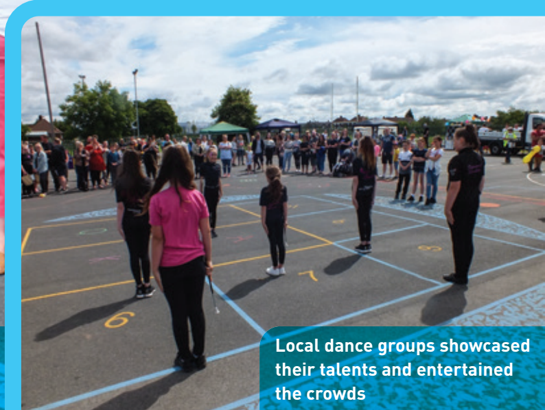
Local dance groups showcased their talents and entertained the crowds