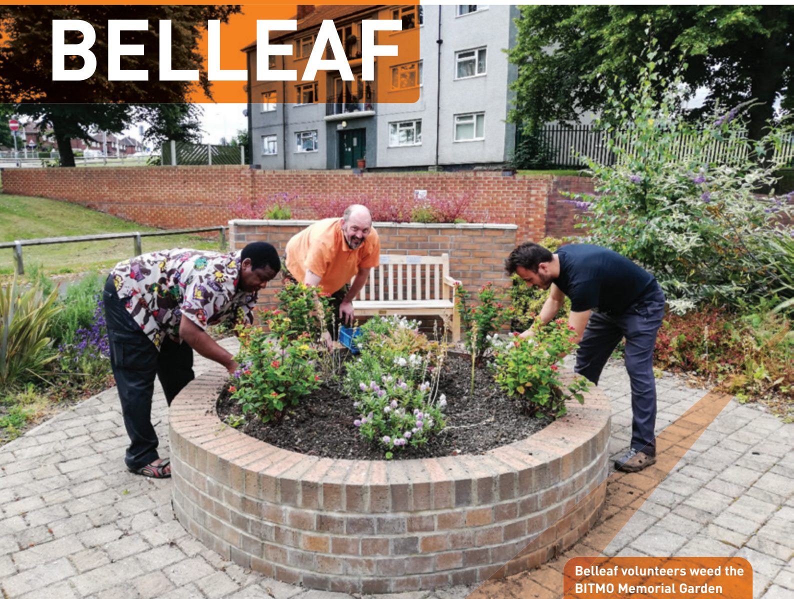
Belleaf volunteers weed the BITMO Memorial Garden

BELLEAF is a new community group that wants to help you get growing food and vegetables locally. They have already got an allotment plot on the site on East Grange Drive and have weeded the Memorial Garden at the BITMO offices. They will be growing tomatoes for the Happy Friday Breakfast Club and vegetables for soup for Tasty Tuesdays.